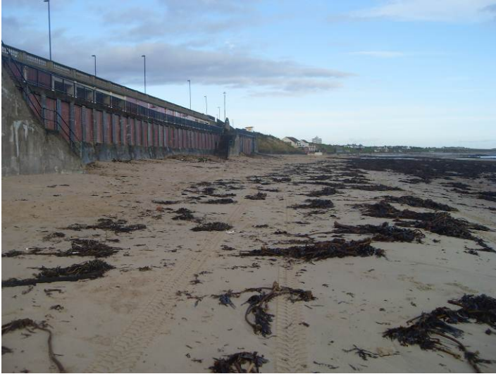
Plate 6 – Survey photograph 1aNTDC04A_20120928_N2