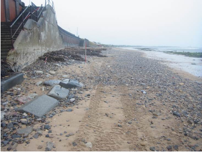
Plate 10 – Survey photograph 1aNTDC04A_20141006_N2