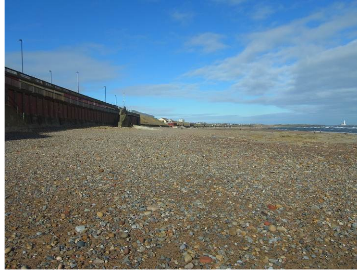
Plate 7 – Survey photograph 1aNTDC04a_20130312_N2