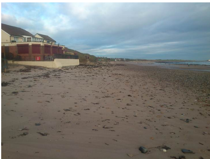
Plate 3 – Survey photograph 1aNTDC04_20131017_N4.jpg