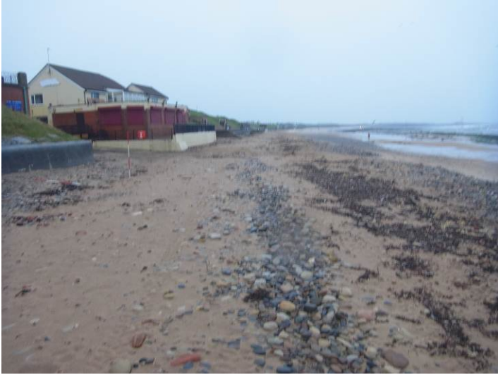
Plate 5 – Survey photograph 1aNTDC04_20141006_N4