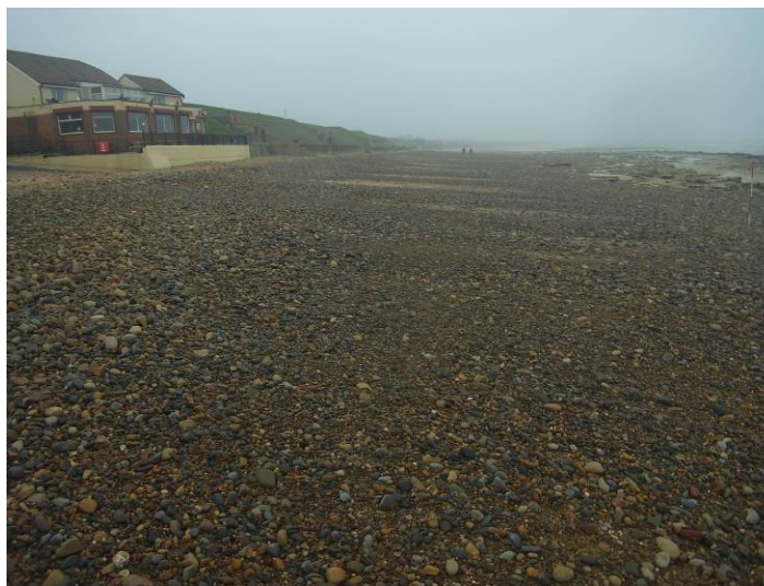
Plate 4 – Survey photograph 1aNTDC04_20140402_N14.JPG