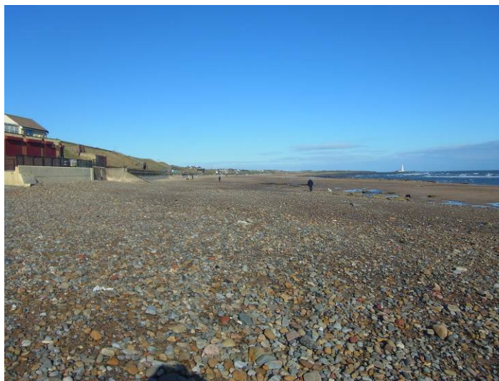
Plate 2 – Survey photograph 1aNTDC04_20130312_N3