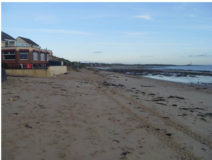
Plate 1 – Survey photograph 1aNTDC04_20120928_N4