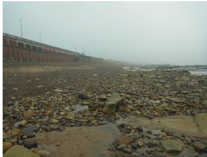
Plate 9 – Survey photograph 1aNTDC04A_20140402_N2